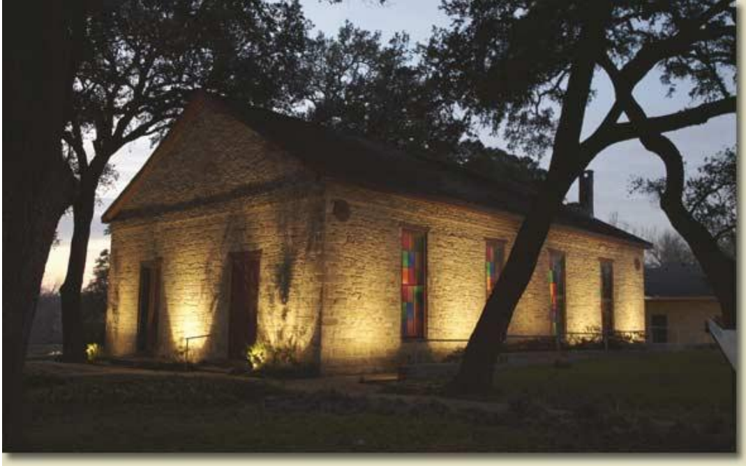
The church Houston attended is still there...Independence Baptist Church.